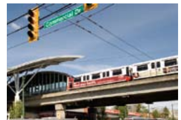
The SkyTrain is on our doorstep!

This new Seniors Housing offers intimate, well designed, comfortable and affordable living for seniors. Located near Commercial Drive, near parks and recreation facilities, near public transportation and within a "walkable" community. You will not find a better setting for seniors who want to enjoy the benefits of the "total community". Right on our doorstep!